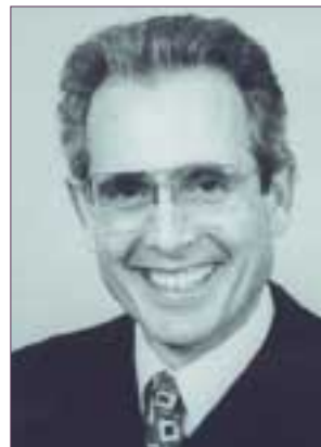
Chief Judge Joseph P. Farina

The Conference’s Executive Committee members from July 1, 2001 through June 30, 2002 are as follows: