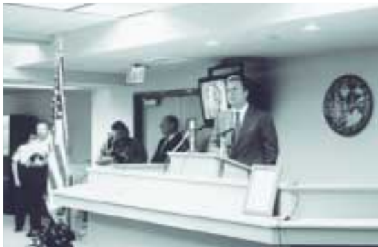
Governor Jeb Bush addresses drug court graduates in Ft. Lauderdale.