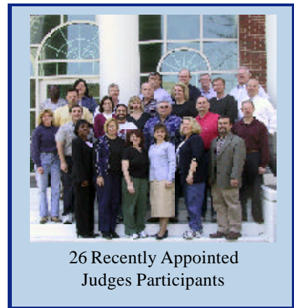
26 Recently Appointed Judges Participants